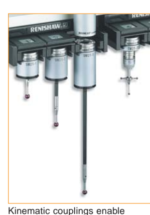
fast, repeatable module and stylus changing