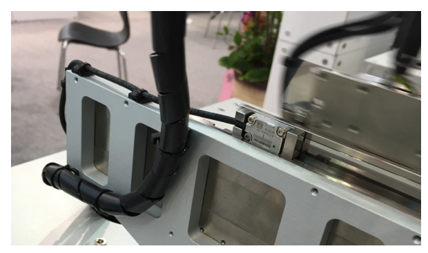
Linear motor assembly

Repair structures integrated into the TFT layer allow white pixel defects to be turned to 'black' or 'dull' by irradiation with a laser. The laser is used in ablation / welding and is focused on the defect to either vaporize it or to create new contacts in the case of TFT repair. The spot-size (diameter) of the laser beam needs to be carefully controlled so as to encompass the defect but leave the normal substrate around it undamaged. Precise manipulation of the laser aperture, in the range of 5 - 50 microns (µm) in diameter, is vital to ensure successful panel repair and improved process yield.