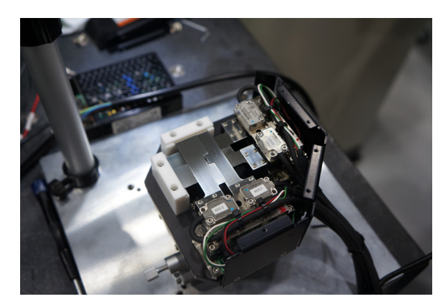
TPC four voice coil motors equipped with an ATOM encoder system

ATOM's miniature readhead is only 7.3 mm x 20.5 mm x 12.7 mm (FPC cable variant) and is ideal for applications with limited space.