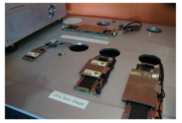
Linear motor bearing assembly