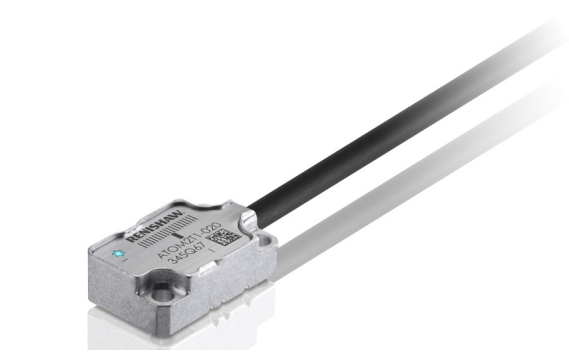
ATOM miniature encoder

Mr Hyun-Joo Hwang, director of TPC Motion, explains: "The laser aperture stop consists of four moving vanes arranged in crossed pairs. Each vane is driven by an individual voice coil motor with a maximum travel of only 2 mm. All four voice